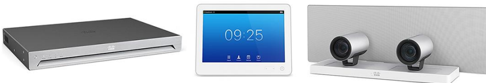
Figure 2. Cisco TelePresence SX80 Integrator Package with Touch 10 and SpeakerTrack 60

With its powerful media engine, the SX80 Codec lets you build the video collaboration room of your dreams.