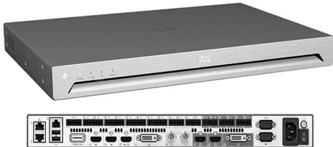
Figure 1. Cisco TelePresence SX80 Codec

Cisco offers three SX80 Integrator Packages to reduce the need for external equipment and the overall cost of enabling video in larger meeting rooms: